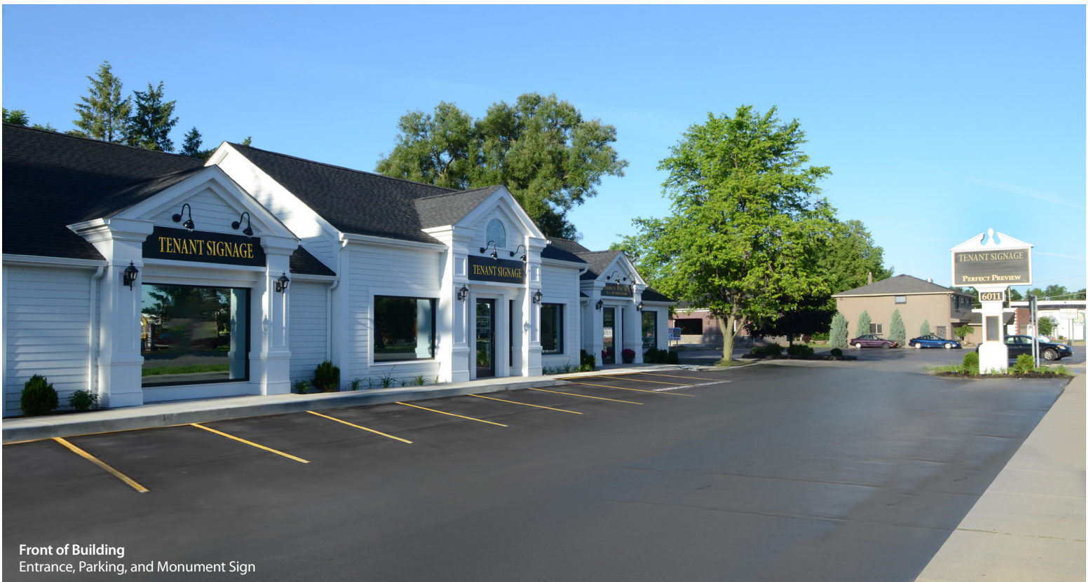
Front of Building Entrance, Parking, and Monument Sign