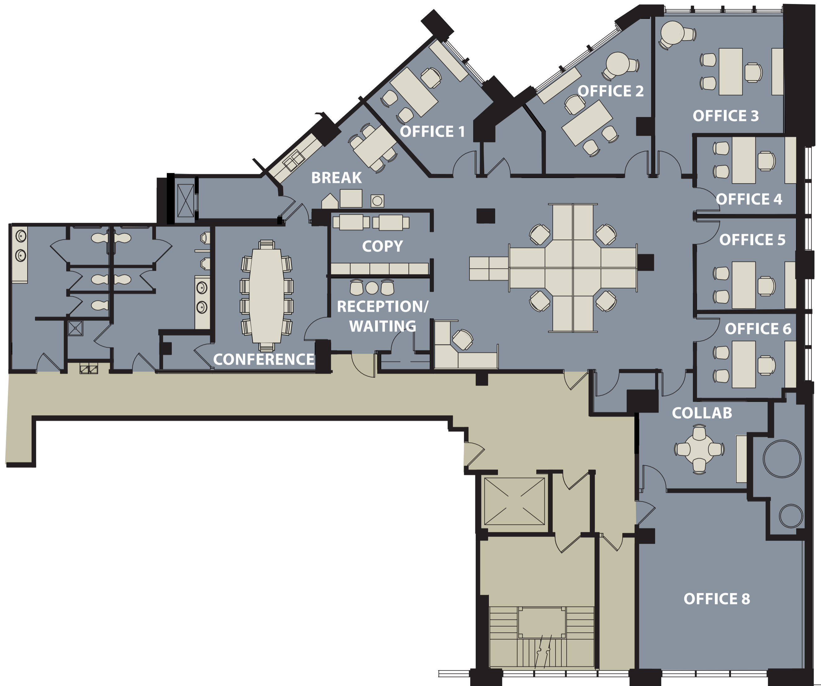
Existing Floor Plan with Sample Furniture Layout