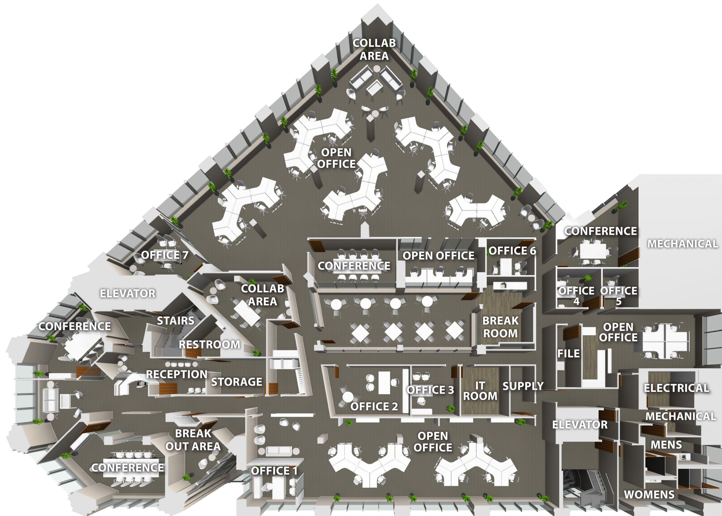
Proposed Floor Plan with Sample Furniture Layout - Suite 500